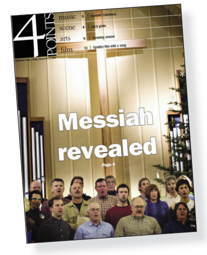
4 Points: Your guide to weekend entertainment