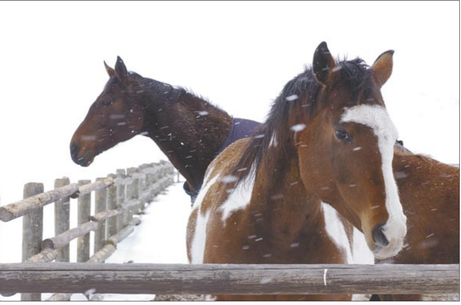
Horses weather a spring snowstorm Thursday afternoon off Routt County Road 14 at Sidney Peak Ranch.