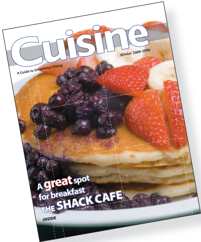
Cuisine: A guide to Steamboat dining